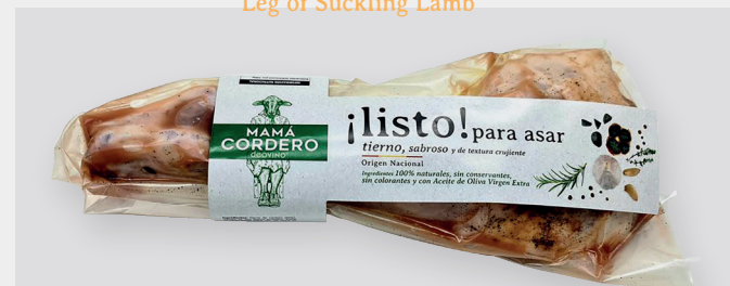
Leg of Suckling Lamb