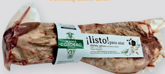
Suckling Lamb Loin